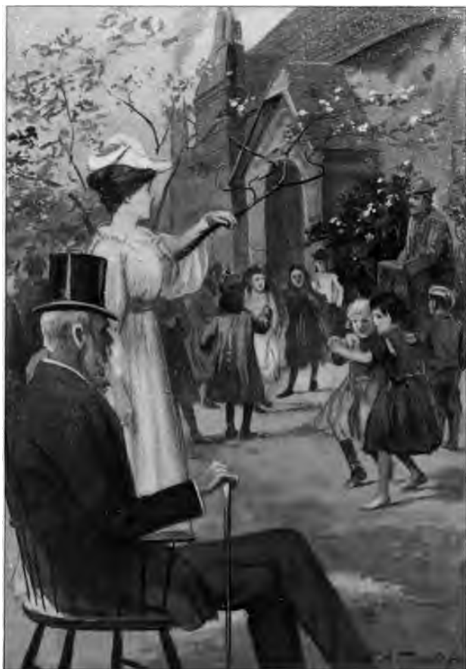
A Garden Party.—Page 273